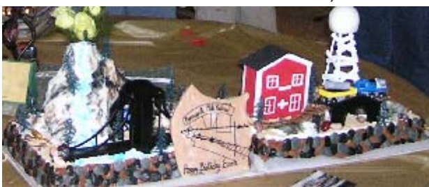
That's quite the birthday cake of the Bonneville Mill and Railroad!