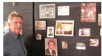
Everyone took a trip down memory lane looking at the "Ennis Gallery".