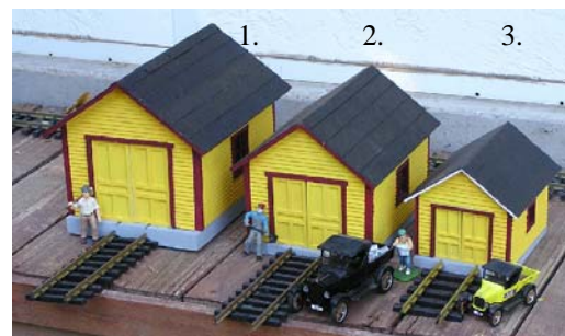
These structures show how greatly the size varies.

In next month's newsletter, I will discuss scaling our landscape to make features look pleasing to the eye and in proportion to the trains, buildings, and figures.