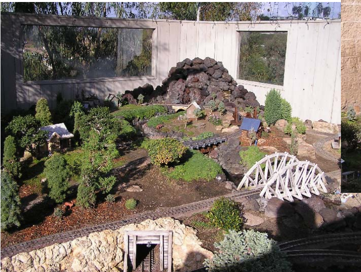
Sue Piper's layout (of Rainbow Ridge Kits) is a good example of dwarf trees and shrubbery. She sure has a knack for making the dwarf trees look real and it is a good example of her product line.