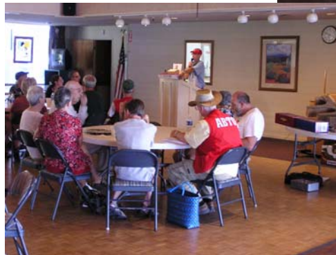
There were about 7 tables of 10—a real good turn out for a summer meeting, and time to socialize.