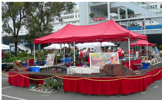
ABTO puts on the last great show in front of the Queen!

Two weekends ago, the Module Group made their final trip to The Big Train Show at the Queen Mary. Next year the annual show will be held in Ontario, CA at a large exhibition hall. The same venue will continue except the "earth shattering horn" won't sound at 12:00 noon and 3:00 PM. They are expecting more vendors, people, and participation, due to the creation of the new show.